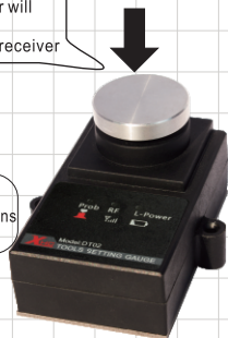
对刀仪触发端 Trigger Transmitter